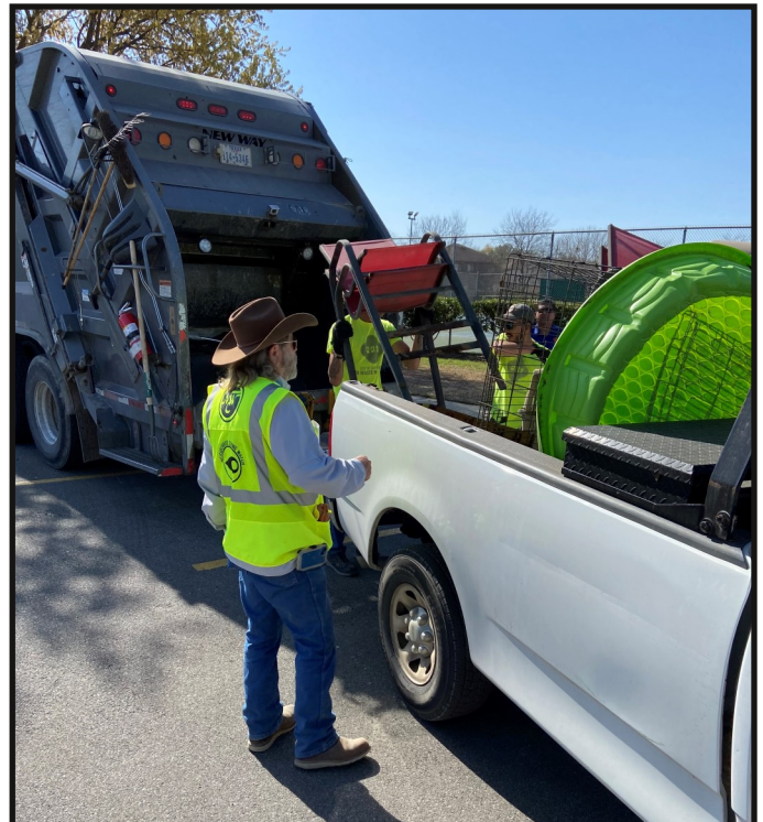
Community Clean-up on March 26th

Thank you to everyone in our Northwest Crossing Community for coming to the Dial-a-Trailer we had on March 26th! Let's continue to improve and keep our community clean.