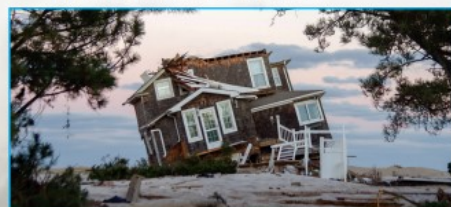
Mantoloking, N.J., Nov. 5, 2012 - This house was destroyed by the storm surge of Hurricane Sandy.